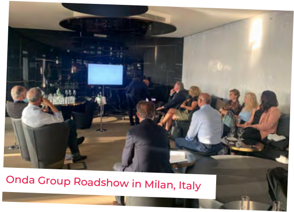
Onda Group Roadshow in Milan, Italy